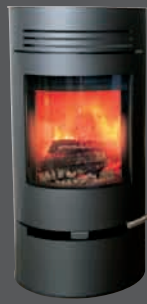
Aduro 1 with drawer