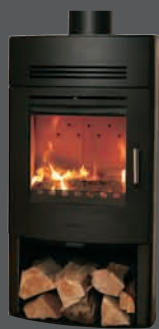
Aduro 3 with wood tray