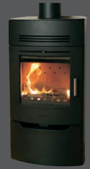
Aduro 3 with drawer