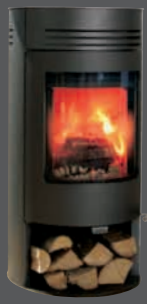
Aduro 1 with wood tray